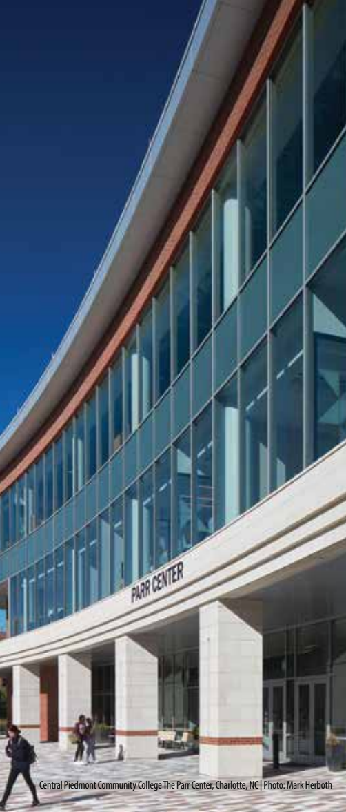
Central Piedmont Community College The Parr Center, Charlotte, NC