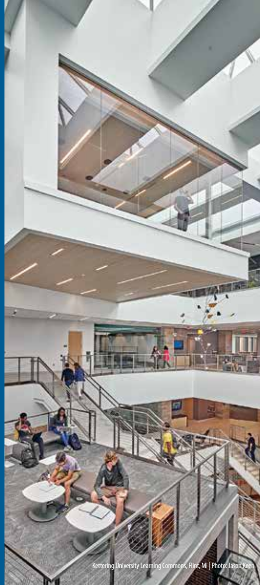
Kettering University Learning Commons, Flint, MI